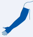
SLEEVE WITH MITTEN