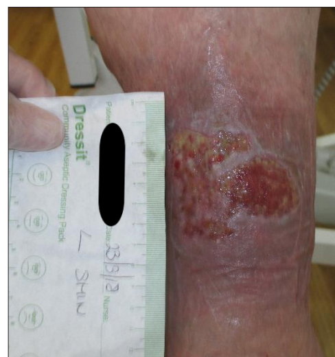
Figure 10 (left). Case study 3: The wound at initial presentation.