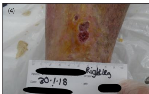
Figures 4–7 showing improvement in wound and surrounding skin while using easywrap over a 6 week period.