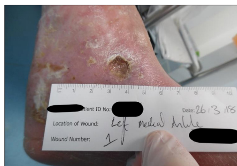
Figure 11 (right). Case study 3: The wound following 3 weeks of treatment with easywrap.