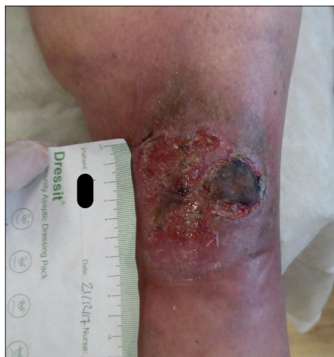
Figure 8 (left) and Figure 9 (right) show improvement in the wound bed following 12 weeks of using easywrap.