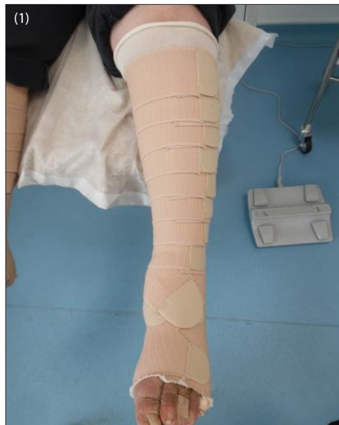
Figures 1 and 2. Easywrap in situ.

a patient goes from supine to standing (Nazarako, 2017). This leads to venous insufficiency and due to increased capillary filtration into the tissues, will often predispose the patient to oedema formation (Elwell, 2015). This is due to the impact that venous insufficiency has on the capacity of the lymphatics which, as well as functioning as part of the immune system, has a primary role in the transportation of 100% of interstitial fluid back into the circulatory system (Woodcock and Woodcock, 2012). The lymphatic system becomes overwhelmed and unable to effectively transport the fluid which, if left untreated and present for more than 3 months, will be defined as a chronic oedema (Moffatt et al, 2016).