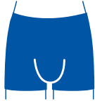
Male Compression Shorts