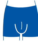
Shorts with Fly